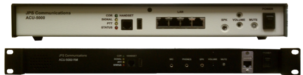
Top: ACU-5000 table top version. Bottom: ACU-5000 rack mount version.