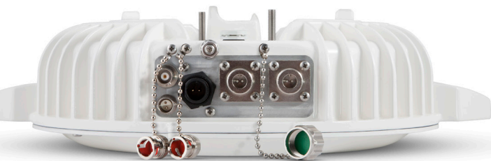
CFIP Lumina Optical

CFIP Lumina systems are intended for Gigabit Ethernet backbone applications delivering up to 366 Mbps per radio. 2+0 aggregation is available for higher bandwidth users. Both single or dual, electrical and fibre optical interface versions are available, as well as hybrid version with 1 optical and 1 electrical port.