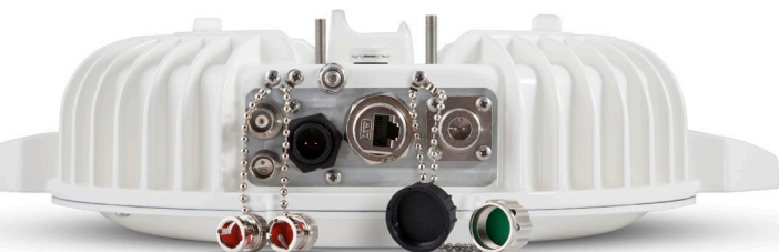
CFIP Lumina Hybrid

CFIP Lumina systems are intended for Gigabit Ethernet backbone applications delivering up to 366 Mbps per radio. 2+0 aggregation is available for higher bandwidth users. Both single or dual, electrical and fibre optical interface versions are available, as well as hybrid version with 1 optical and 1 electrical port.